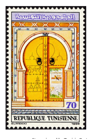
Stamp issued by Tunisia Post

Tunisia was an early leader in digital payments. It has engaged actively and consistently to foster the transition from cash to digital financial services (DFS) to improve the economic wellbeing of its population and business community. Inclusion in digital financial services can provide more economic security to store and accumulate assets safely, along with democratization of wealth through increased participation and opportunity. Financial inclusion has been defined as "a state in which households and businesses have access to a range of financial services that meet their needs: savings, payments services (including money transfer), credit, and insurance."1 Increased DFS activities generate both economic and social benefits.