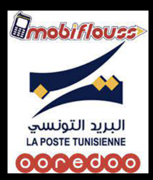
Tunisia mobile payments advertisement